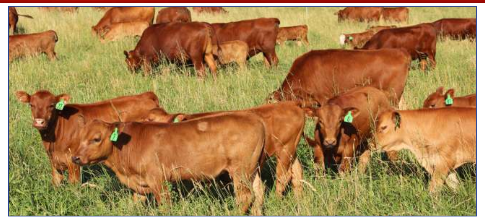
Outstanding cattle like these will be available for viewing on June 24 and 25 at Woods Fork Cattle Co.