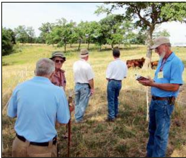
There was always a good crowd present to view the cattle.