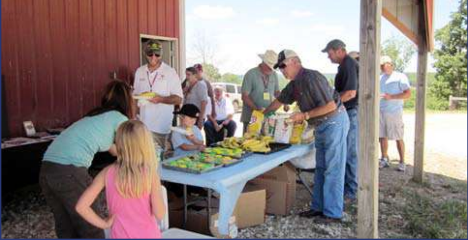
Attendees had an opportunity to eat three meals during the two days of the event.