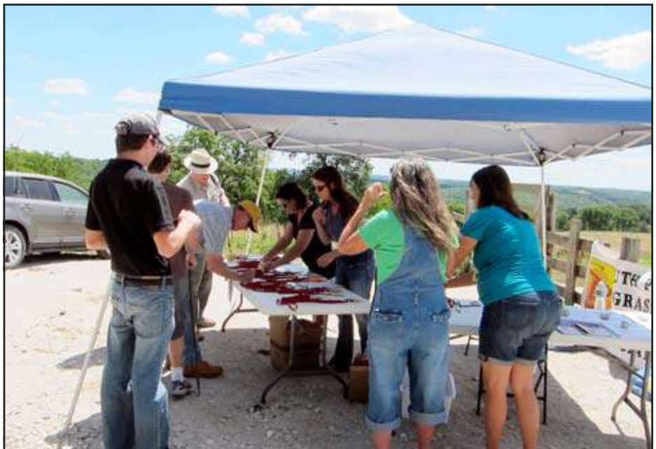
Early in the day the registration desk was a very busy place.