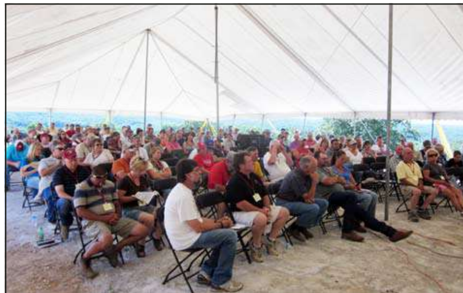
A large crowd attended Friday afternoon's management practices forum.