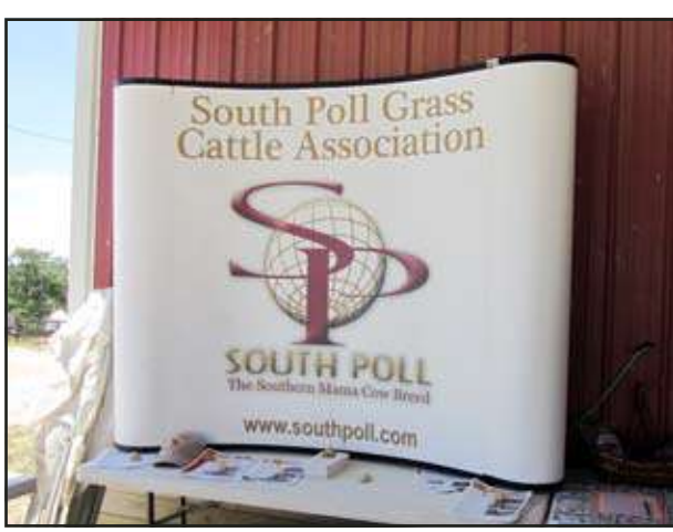
South Poll display