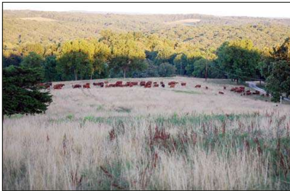
Part of the Voss cow herd – in the background is the eastern part of Osage County and beyond that Gasconade County.