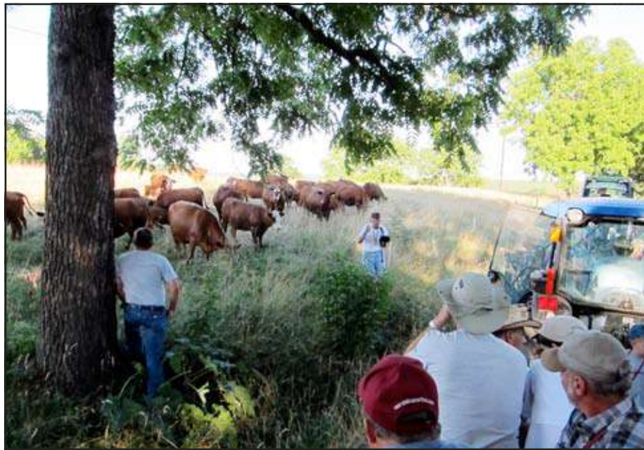
It took a people mover, a hay wagon and about three pickups to transport those going on the farm tour Friday night.