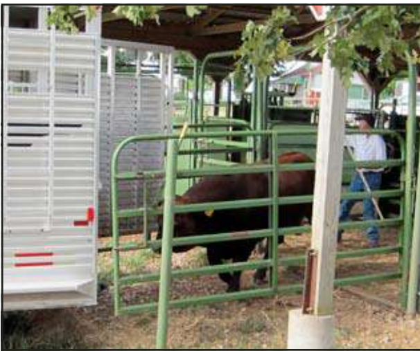
The ultra-gentle South Poll animals that sold Saturday loaded late that afternoon without incident.