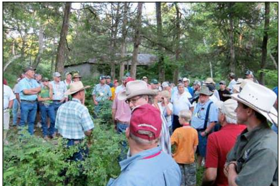
People enjoyed looking at the 90,000-gallon-per-day Hollenbeck Spring during Friday night's farm tour.