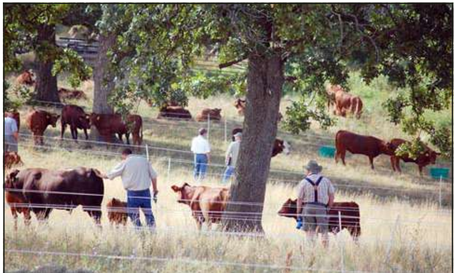
People interested in viewing the 21 lots offered in Saturday's sale went into some of the six pens to get a close-up look at the animals. The bidding Saturday was spirited, with the top cow/calf pair going for $4,500 and the top heifer $4,200.