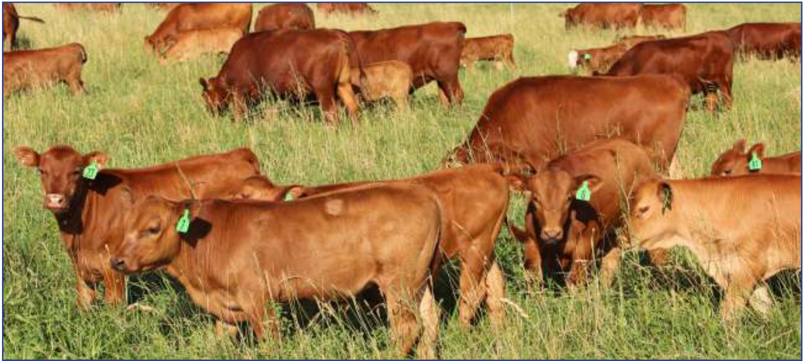
Outstanding cattle like these will be available for viewing on June 24 and 25 at Woods Fork Cattle Co.