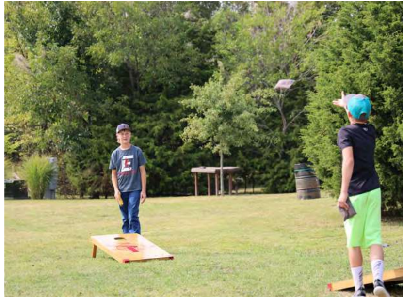
South Poll Corn Hole