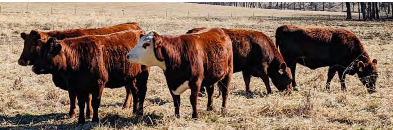
Houston 2022 Bred Heifers

2.18.22--Ark-LA-Tex Regen Ag Conference --Greg Judy speaking 2.22.22--Spring Forage Conference Springfield MO--come visit us at our booth! 2.28.22 thru 3.6.22--International Room Houston Livestock Show and Rodeo 3.2.22--Houston All Breeds Show NRG Arena Houston, TX 5.18.22 thru 5.20.22--Grassfed Exchange 6.24.22 thru 6.25.22--Field Day & Auction Roseland, LA